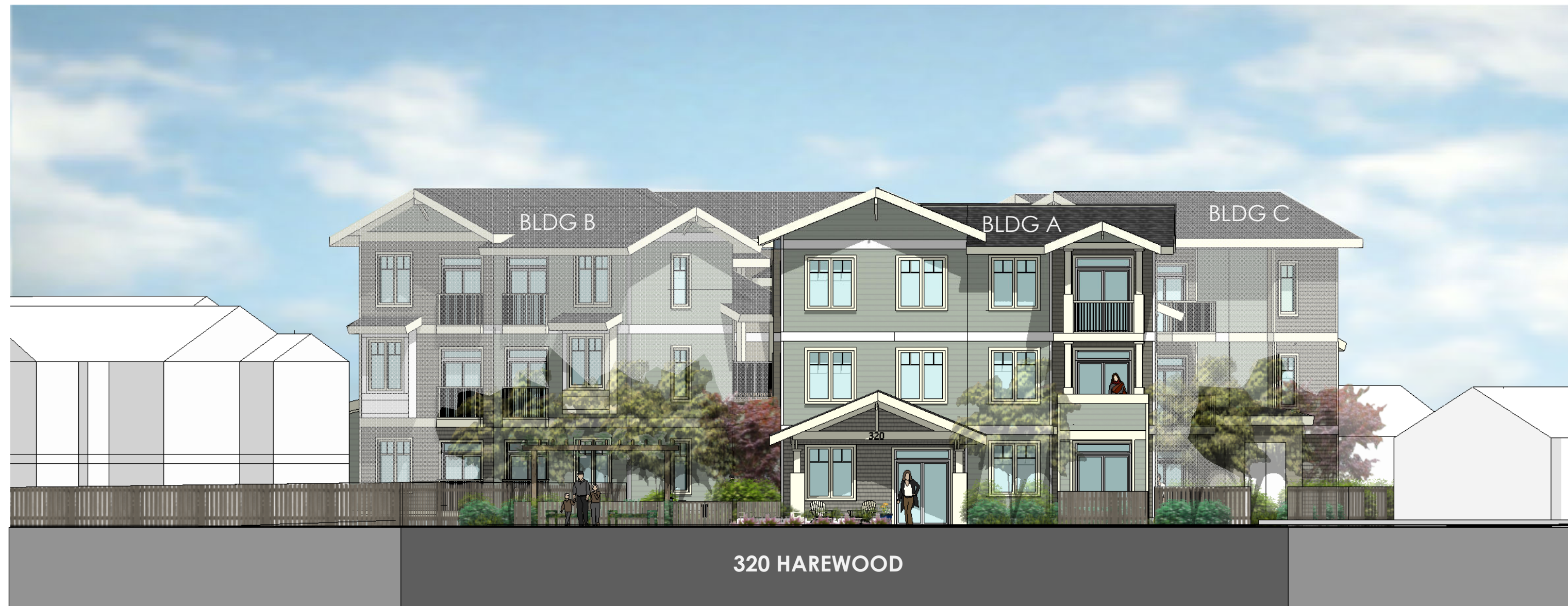
EAST ELEVATION ALONG HAREWOOD ROAD